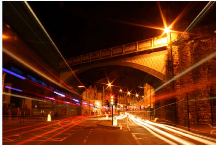
Luke Palmer – Arches