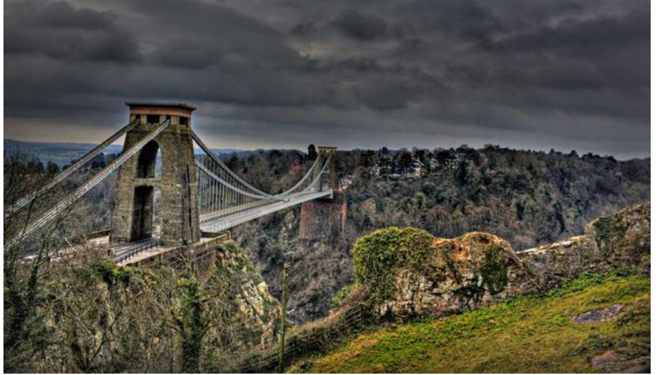
Suspension - Jem Salmon